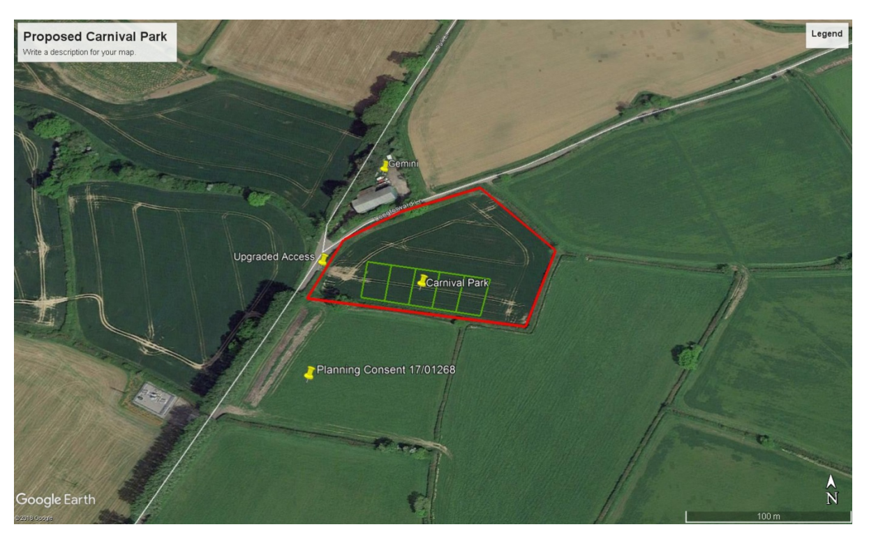
Above - proposed location of Carnival Park